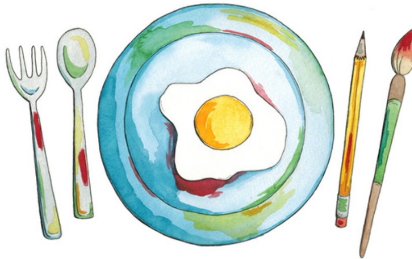
Table Host Toolkit

10:00 AM: Event ends , at which point guests are free to leave or linger and catch up with you for a few more minutes.